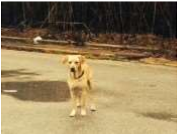
The yellow dog is the one that attacked the little dog in the yard and threatened the woman on the street.